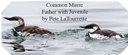
Common Murre Father with Juvenile