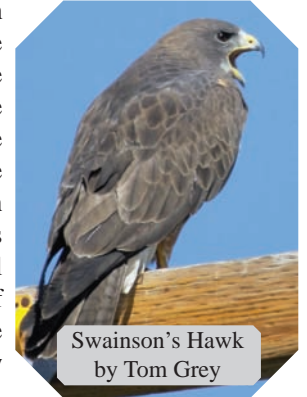
Swainson's Hawk

Swainson's Hawks congregate in the lower Sacramento Valley in late summer as they prepare to leave for Mexico and Argentina for the winter. They rest up and gorge themselves in preparation for the trip, taking advantage of the rich riparian and agricultural resources of Yolo County. This is a wonderful opportunity to see a wide variety of Swainson's Hawks, their multiple morphs and ages, and get to know them on a more intimate basis. Perhaps the most graceful Buteo, often the most beautiful, clearly the long-distance migration sweepstakes winner (Alberta to Argentina); you owe yourself a good visit with these magnificent raptors.