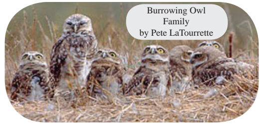
Burrowing Owl Family

Our campaign to save the burrowing owls of Shoreline at Mountain View is bearing fruit! Since September 2009, dozens of activists engaged in an effort to encourage the city of Mountain View to re-examine its policy regarding mitigation measures for burrowing owls, and to create a burrowing owl sanctuary at Shoreline. Our advocacy resulted in the city abandoning off-site mitigation plans, and instead starting to work on a new management plan for the owls with the goals of protecting and enhancing nesting and foraging habitat for Burrowing Owls at Shoreline Park, and of increasing the number of nesting pairs in the park. In May