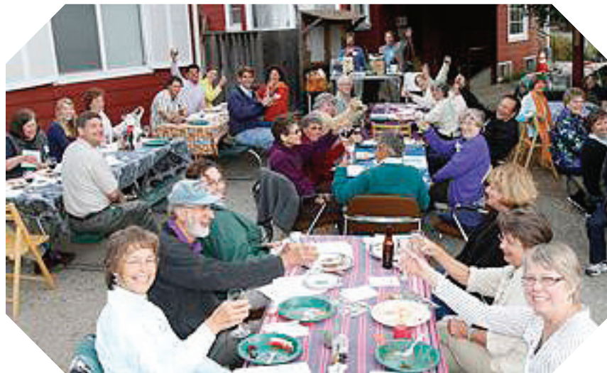
Birders Know How to Party! The Annual Birdathon Dinner is always a fun way to enjoy each others' accomplishments. Everyone comes away with a big smile.