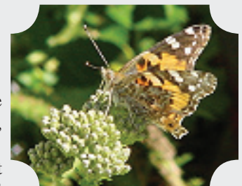
Butterfly on Milkweed by Arvind Kumar

The plants will require little water this year, perhaps only a gallon per plant, avoiding the crown, twice in August and once in September. Established plants should be able to survive until the fall rains. First-year plants need additional attention, as they easily succumb to overwatering or dry soil. Many of our plants were lost as this lesson was learned. As the summer progresses, the garden will require a bit of pruning, some deadheading, and some summer rest. Now the garden volunteers can turn our attention to summer fun and relaxation!