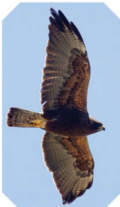
Swainson's Hawk

NOTE: You must be willing to carpool and share fuel expenses with a minimum of 3 other people to attend this field trip. We will have a maximum of 4, 4-person vehicles on this field trip.