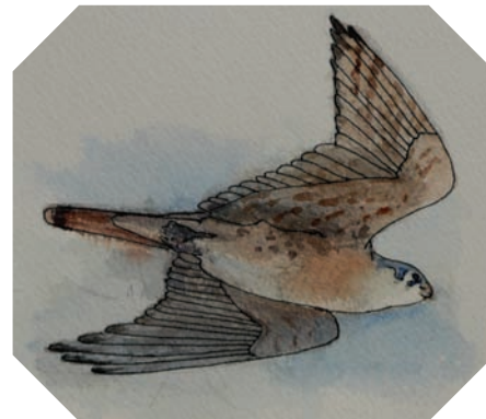
Sketches by Floy Zittin