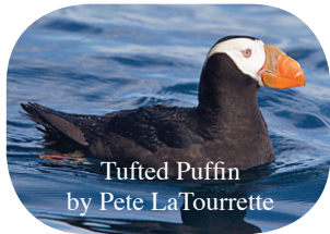
Tufted Puffin by Pete LaTourrette

The following classes are sponsored by the SCVAS Education Committee. To register please call the office at (408) 252-3740. All cancellations require 72-hour prior notification for refunds. Information about our upcoming classes is also available on our website at www.scvas.org .