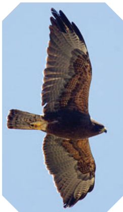
Swainson's Hawk

NOTE: You must be willing to carpool and share fuel expenses with a minimum of 3 other people to attend this field trip. We will have a maximum of 4, 4-person vehicles on this field trip.