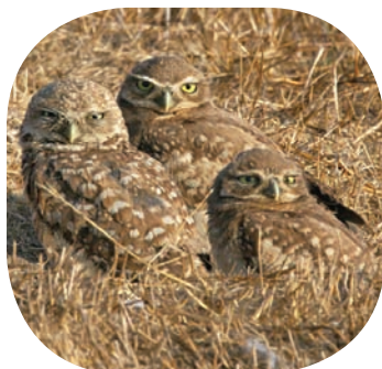
Burrowing Owls