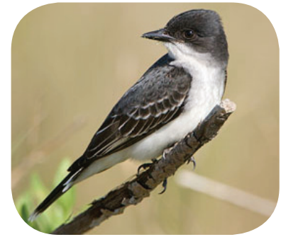
Eastern Kingbird

(RFu). The adult Harris's Sparrow in a Campbell yard was last seen on 22 Apr (LMY). A male Blue Grosbeak was found at Ed Levin CP on 21 Apr (DWe), another was along Holsclaw Road and Llagas Creek the next day (PDU). A male near the end of Marsh Road was observed 24-28 Apr (GR, m.ob.). The last of the spring was a singing male near Monterey Road north of the Llagas Creek crossing in Morgan Hill (SCR). This spring seemed to be the breakthrough moment for Great-tailed Grackles . They were found in 13 sites from Casa de Fruta to the Geng Road pond. At Lake Cunningham at least 6 pairs nested and some successfully fledged young. The spigot for Lawrence's Goldfinches finally turned on in mid-April and they were found in many locations in the Diablo Range, on the valley floor, and in the Santa Cruz Mountains. Nesting was observed along San Felipe Road on 26 Apr (MJM, LCr), in Ed Levin CP on 28 Apr (BH et al., MJM), and on Route #1 in Henry Coe SP on 17 May (SCR).