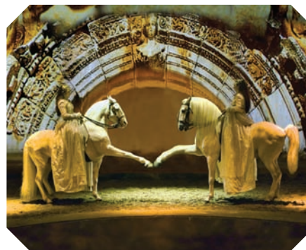
Riders and their horses in CAVALIA

The summer of 2012: When the majestic horses of Cavalia came to the aid of the magical burrowing owls of San Jose. See a clip of the show at http://www.youtube.com/watch?v=F4pcsZoxv3U . Extraordinary!