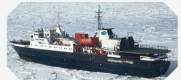
The expedition vessel, the Ortelius

Join us on a voyage of discovery to an awe-inspiring world devoted to nature, wildlife, science, and peace. Our expedition to the Antarctic Peninsula allows time for a vast breadth of landings beyond the realm normally traveled, unhurried and intimate with wildlife and landscapes, sites others are forced to omit or merely rush through. Board the safe and comfortable Ortelius for an unparalleled ten to eleven landing days along the Antarctic Peninsula. Enjoy extensive exploration of the remote and iceberg-filled Weddell Sea, the many wildlife-rich areas in the northern Peninsula and South Shetland Islands, and wonderful sites further south along the western Peninsula. Maximum time on shore will be available for photography, wildlife observation, and traversing the landscapes of the great Antarctic. Our priority is assuring the most in-depth wildlife experience in the Antarctic, an experience made possible by our comprehensive itinerary and committed expedition staff of Antarctic veterans.