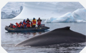
Zodiac cruising alongside a Humpback Whale

Cheesemans’ Ecology Safaris, our biggest supporters and favorite eco-tourism company on the planet, has made a very generous offer to support our chapter by sharing the proceeds from their upcoming Antarctica trip. Go to Antarctica, have a blast, have the trip of a lifetime AND support our work locally at the same time.