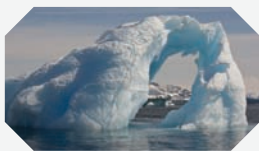
Just one of many majestic iceberg views

Join us on a voyage of discovery to an awe-inspiring world devoted to nature, wildlife, science, and peace. Our expedition to the Antarctic Peninsula allows time for a vast breadth of landings beyond the realm normally traveled, unhurried and intimate with wildlife and landscapes, sites others are forced to omit or merely rush through. Board the safe and comfortable Ortelius for an unparalleled ten to eleven landing days along the Antarctic Peninsula. Enjoy extensive exploration of the remote and iceberg-filled Weddell Sea, the many wildlife-rich areas in the northern Peninsula and South Shetland Islands, and wonderful sites further south along the western Peninsula. Maximum time on shore will be available for photography, wildlife observation, and traversing the landscapes of the great Antarctic. Our priority is assuring the most in-depth wildlife experience in the Antarctic, an experience made possible by our comprehensive itinerary and committed expedition staff of Antarctic veterans.