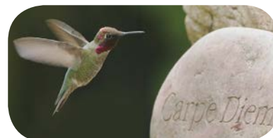
Anna's Hummingbird