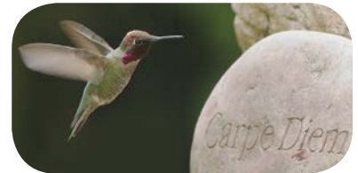
Anna's Hummingbird