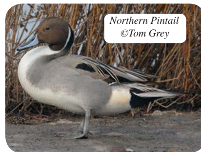
Northern Pintail