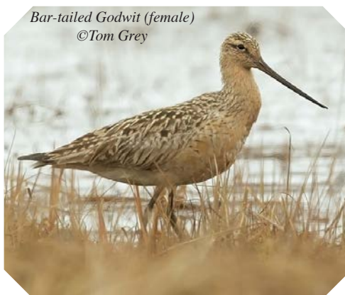
Bar-tailed Godwit (female)

The only report of a Greater Roadrunner was one along Del Puerto Road on 24 Oct (WGB). A Short-eared Owl was seen in the marsh along Coyote Creek north of Pond A9 on 17 Nov (MDo, KDo). The last of the Vaux's Swift passage was of six birds over Monte Bello OSP on 7 Oct (GHa). The HY male Costa's Hummingbird remained at Vasona CP through the end of the period (m.ob.). It has been there for at least three months and three weeks, beating out a 1996 male that stayed at a feeder in San Jose for at least three months and a week, but falls short of the female at a Morgan Hill feeder