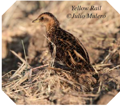
Yellow Rail