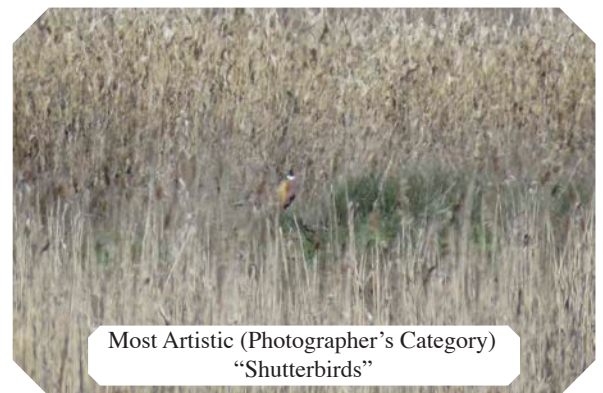
Most Artistic (Photographer's Category) "Shutterbirds"