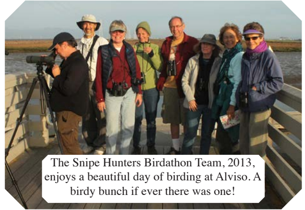
The Snipe Hunters Birdathon Team, 2013, enjoys a beautiful day of birding at Alviso. A birdy bunch if ever there was one!