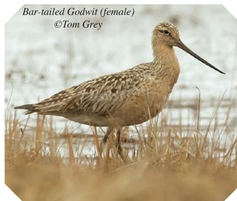
Bar-tailed Godwit (female)

The only report of a Greater Roadrunner was one along Del Puerto Road on 24 Oct (WGB). A Short-eared Owl was seen in the marsh along Coyote Creek north of Pond A9 on 17 Nov (MDo, KDo). The last of the Vaux's Swift passage was of six birds over Monte Bello OSP on 7 Oct (GHa). The HY male Costa's Hummingbird remained at Vasona CP through the end of the period (m.ob.). It has been there for at least three months and three weeks, beating out a 1996 male that stayed at a feeder in San Jose for at least three months and a week, but falls short of the female at a Morgan Hill feeder