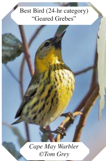
Best Bird (24-hr category) "Geared Grebes"