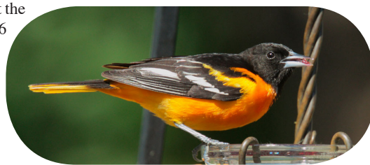
Baltimore Oriole