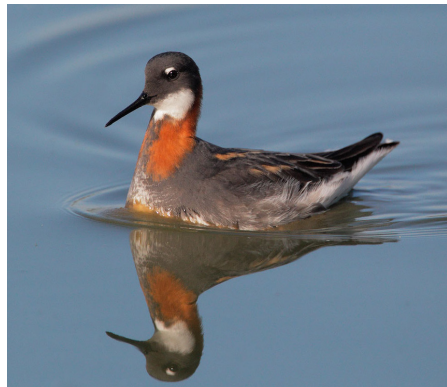
Red-necked Phalarope

Two Greater White-fronted Geese continued to be seen at Byxbee Park and Palo Alto Golf Course through the end of March (m. ob.). The largest gaggle of Cackling Geese was a group of 22 at the Los Capitancillos and nearby ponds on 3 Feb (DG) and 11 Feb (DPv). A single Snow Goose frequented bayside locations in Palo Alto and Mountain View through the end of March (m. ob.). No Ross's Geese were found. One to two Eurasian Green-winged Teal were reported from Charleston Slough through 26 Mar (m. ob.), and another was at Lake Lagunitas on 22 Feb (RFu), a first for that location. A Pelagic Cormorant conveniently flew by an observer with a camera at Alviso Salt Pond A16 on 19 Feb (GL). This is within a few days of the latest winter date a Pelagic Cormorant has