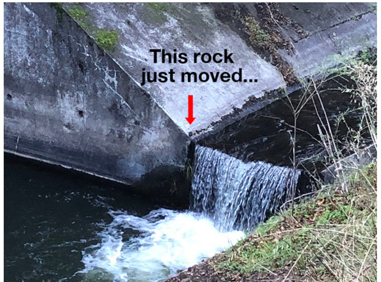
American Dipper along Los Gatos Creek, south of Main Street.