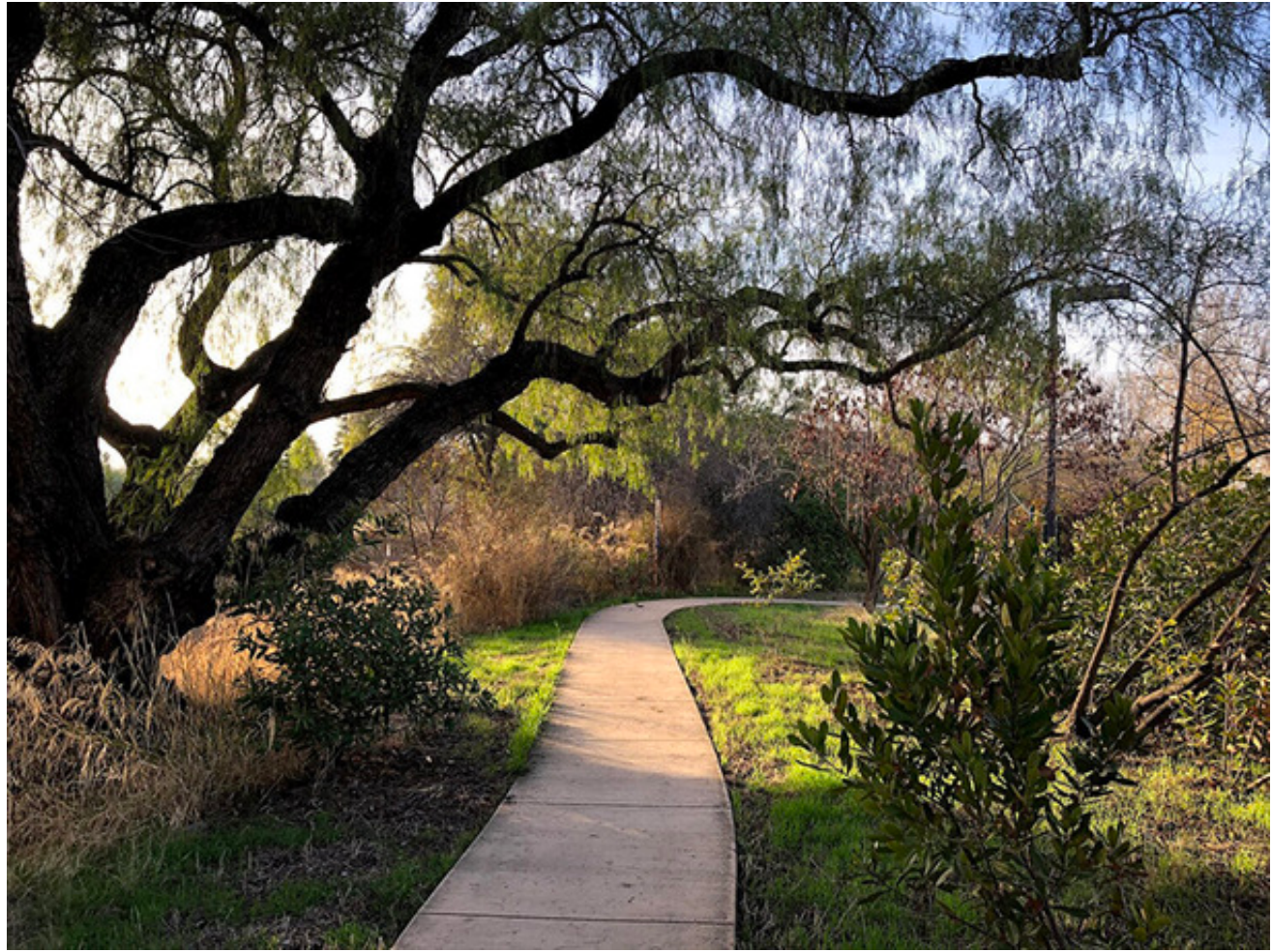
Santa Clara Valley Water District.

Spring is just around the corner and love is already in the air or in the water! Check out mating behaviors of raptors in Coyote Valley or paired up ducks at an urban pond or at the bay. Head to Picchetti Ranch for the oaks or visit Santa Clara Valley Water District Headquarters for some quiet trails. Children in your life having too much Zoom time? Try our new youth-centered trip.