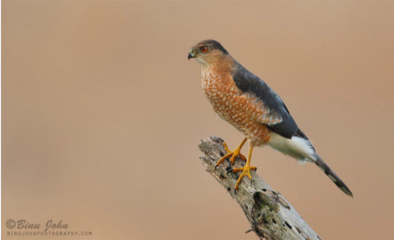
Cooper's Hawk.

You've spotted all sorts of birds in your yards and neighborhoods lately! In this month's <u>All</u> <u>Around Town</u>, read stories and see photos of backyard birds from our members and neighbors, including some of your favorites from 2020.