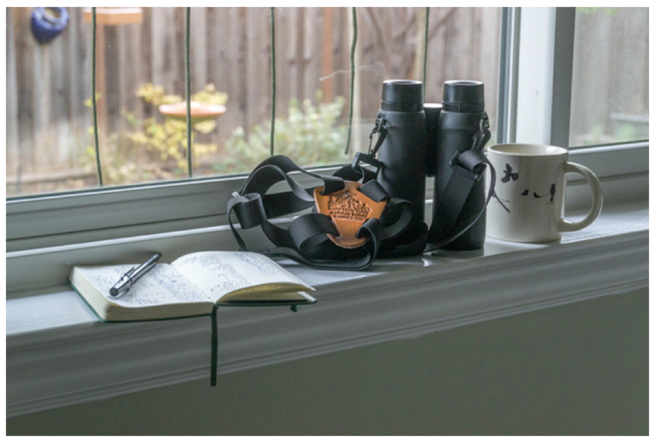
Bird count gear.

It's a new year - challenge yourself to do a regular bird count at home or another favorite spot! In <u>The Habit of Counting Birds</u>, learn how - and why - to record and share the birds you see.