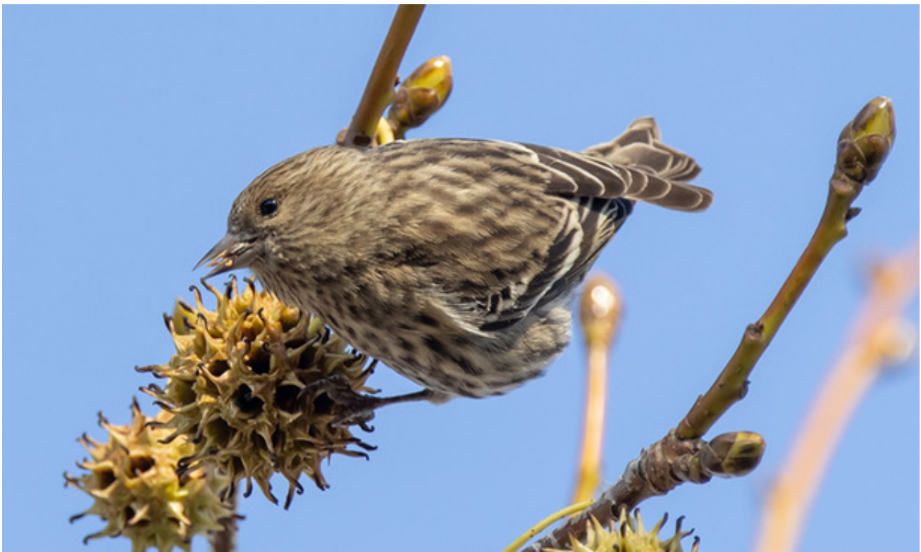
Pine Siskin: Barry Langdon-Lassagne

There is a serious outbreak of salmonellosis right now among Pine Siskins in California and other western states. This deadly, highly contagious disease is observed almost exclusively at bird feeders and baths, places where birds congregate in close proximity, leading to contagion. The disease spreads readily to other bird species, like Lesser Goldfinches and American Goldfinches.