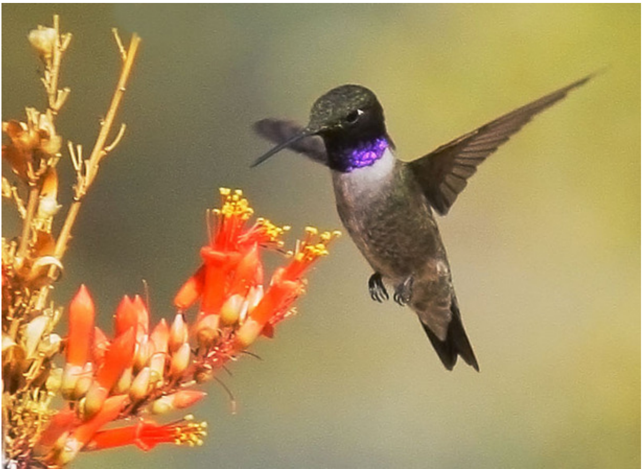
Black-chinned Hummingbird: Tom Grey