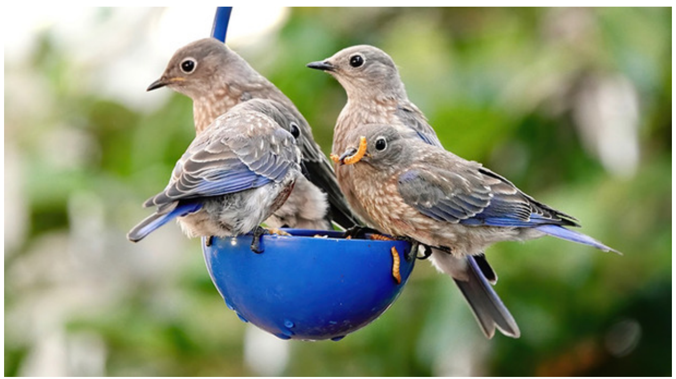
Western Bluebird juveniles: Carter Gasiorowski