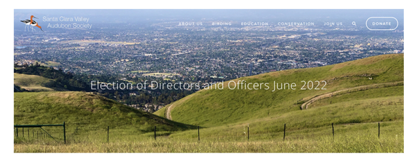
It's almost time to cast your vote!

Please participate and ask Cupertino to Restore the land to its natural habitat. (This alternative includes discontinuing the use of the site as a golf course. This would consist of transitioning much of the existing golf course turf to native, climate-friendly landscaping, removing much of the existing perimeter netting and fencing, construction of a trail network, and design for potential environmental education programming.)