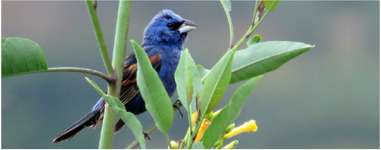
Blue Grosbeak: Gena Zolotar