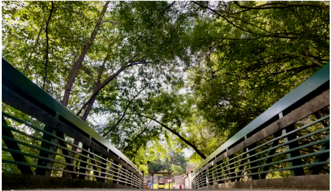
Bridge over troubled creek: Carolyn Knight