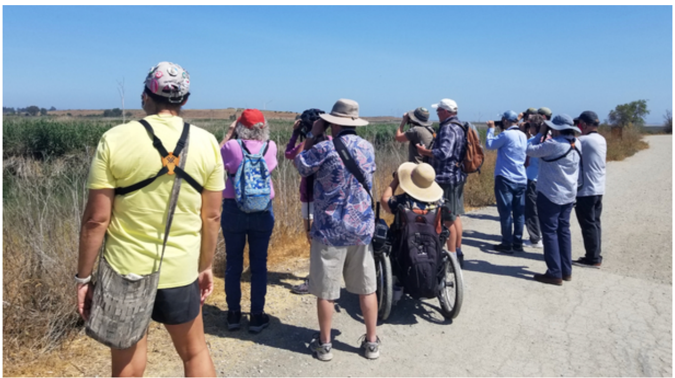
Let's Go Birding Together Trip