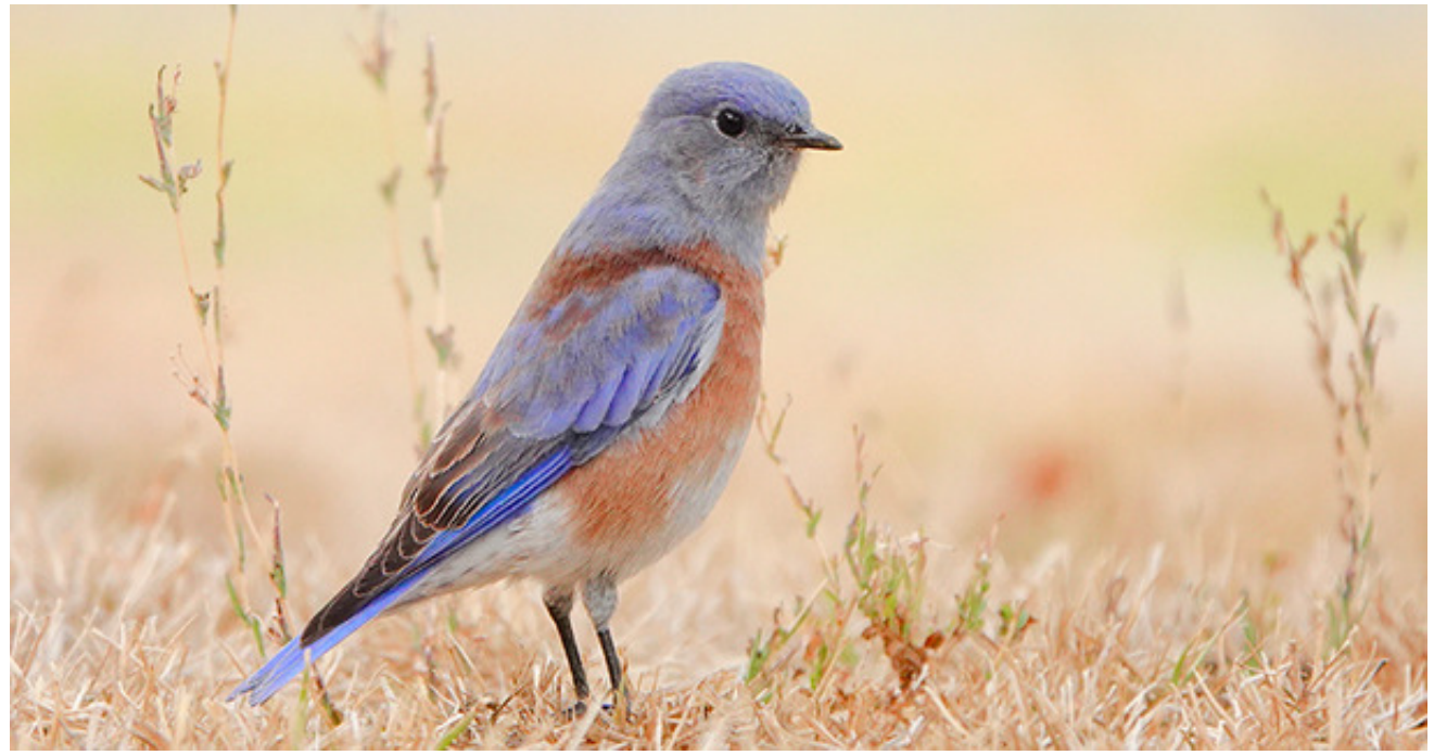
Western Bluebird: Carter Gasiorowski