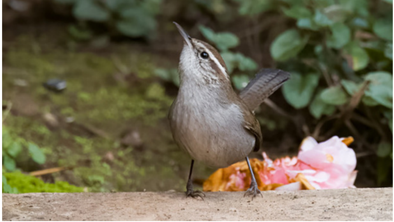
Bewick's Wren: Deanne Tucker