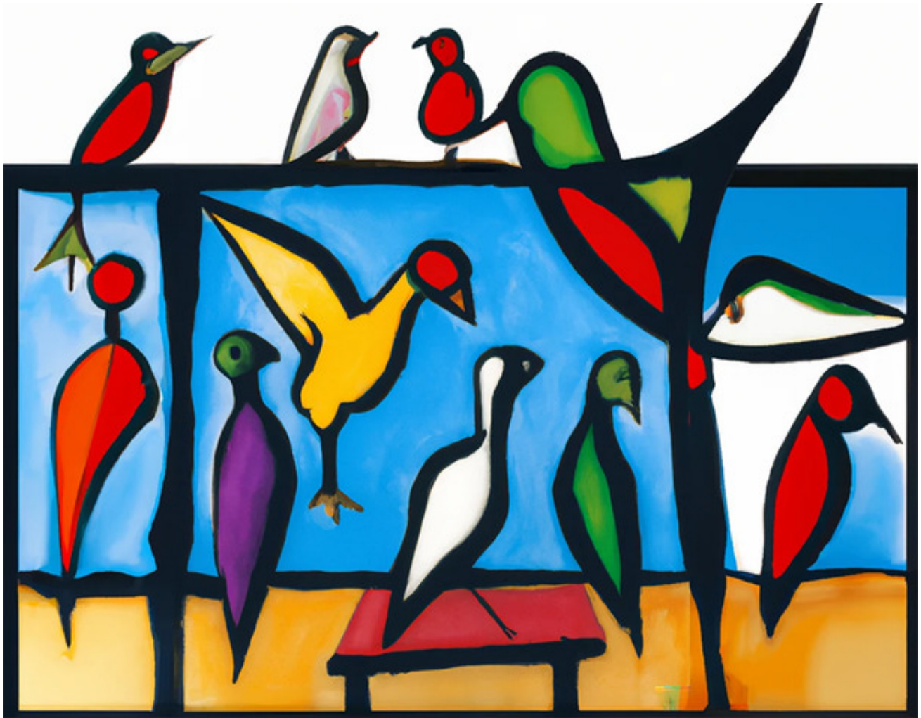
DALL•E2 (AI-generated): My prompt was "an oil painting by Matisse of a bird giving a presentation to other birds"