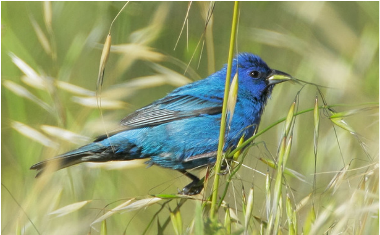
Indigo Bunting: Tom Grey