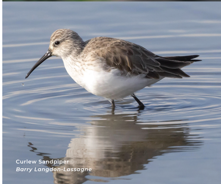
Curlew Sandpiper Barry Langdon-Lassagne