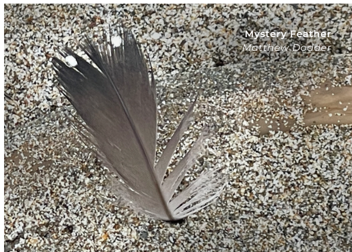
Mystery Feather