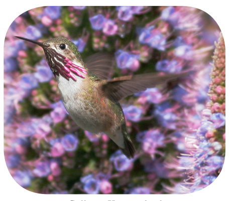
Calliope Humminbird