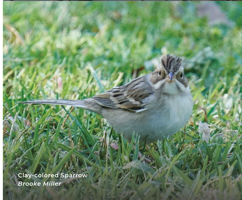
Clay-colored Sparrow