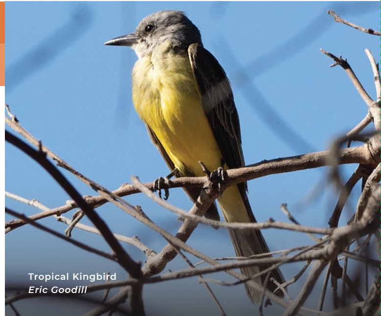
Tropical Kingbird Eric Goodill

Western Gulls nested successfully this year, with an occupied nest noted on 1 Jun at pond A2W (WGB) and two juvenile gulls present on closed refuge ponds on 25 Aug (MMR, MJM, RJ). The high count of Elegant Terns this fall was fourteen over pond A2E on 15 Aug (RPh). Eleven were tallied on a survey of several ponds at the south end of the bay on 1 Sept (MJM, RJ). A Common Tern on migration stopped at