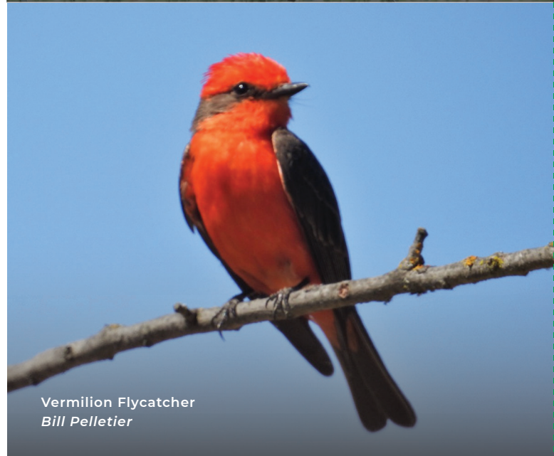
Vermilion Flycatcher Bill Pelletier