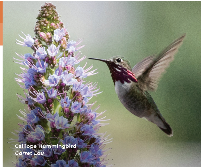
Calliope Hummingbird Garret Lau

The last date a Short-eared Owl was seen over the Palo Alto Flood Control Basin was 13 Apr (FP). Hummingbird activity picked up on 5 Apr, when the first Black-chinned Hummingbird of the year visited feeders in a Willow Glen