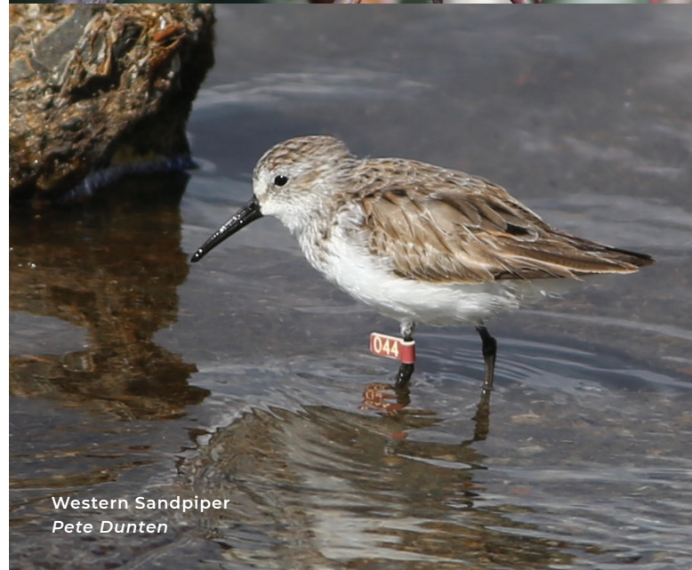
Western Sandpiper Pete Dunten