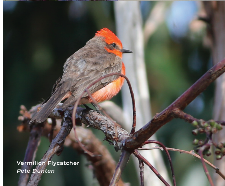
Vermilion Flycatcher Pete Dunten