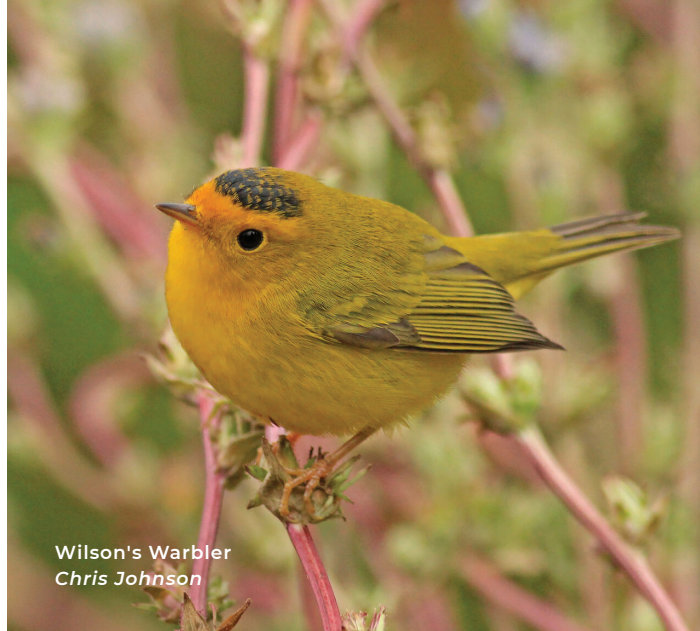
Wilson's Warbler

A Green-tailed Towhee was a nice find on 26 Dec along the Calero Creek Trail (WGB). The Towhee, the second found in the county in 2020, has stayed through the end of January. An unusually late Yellow-breasted Chat stopped at a bird