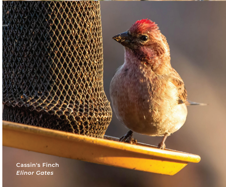
Cassin's Finch Elinor Gates